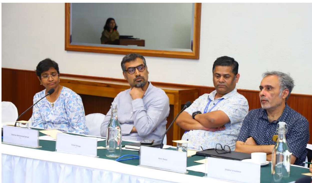
FIGURE 5 | Panelists discuss the current policy landscape and a collective needs assessment