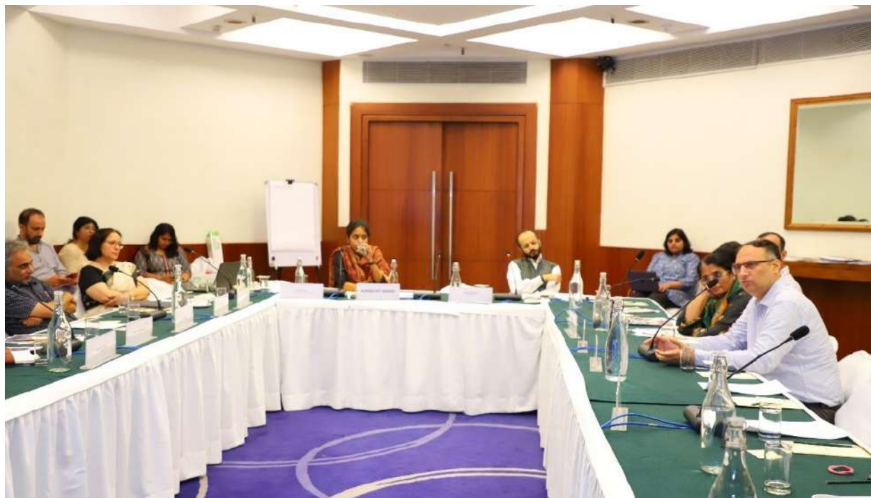
FIGURE 8 | Panelists in the session on current planning processes, tools, and data that Indian cities and states use