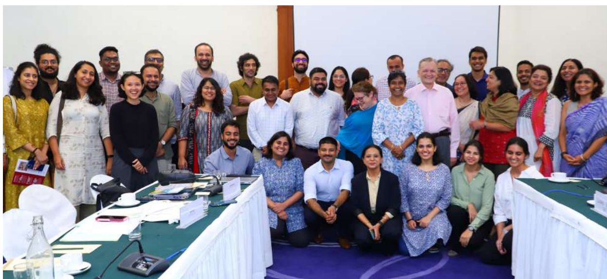
FIGURE 1 | REHOUSE India convening partners and participants